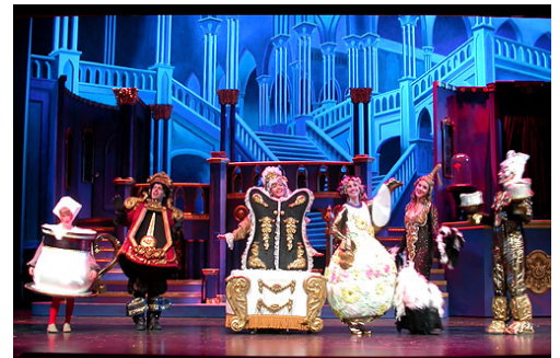
Scenery and characters from our Premium Beauty & the Beast collection

Specialty effects and props for other flying productions round out the theatrical menu. Rentable pieces for the Wizard of Oz include Glinda's floating bubble, the Wizard's hot air balloon basket and an automated spinning tornado. An enchanted flying carpet is available for productions of Aladdin .