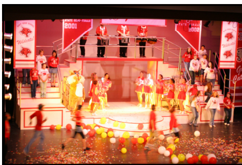
Our new HSM set and costumes in action

Ampitheater, Louisville, KY. To visit the ampitheater's photo gallery, go to www.iroquoisamphitheater.com .