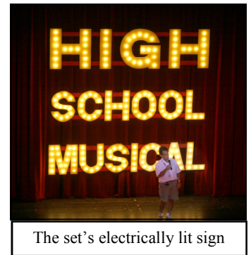
The set's electrically lit sign

Amenities for this set include two wide-screen monitors, eight large TV tubes, two confetti volcano units and two 18-foot inflated air dancers with fans. In addition are professionally designed and printed vinyl signs as well as a large electrically lit sign displaying "High School Musical".