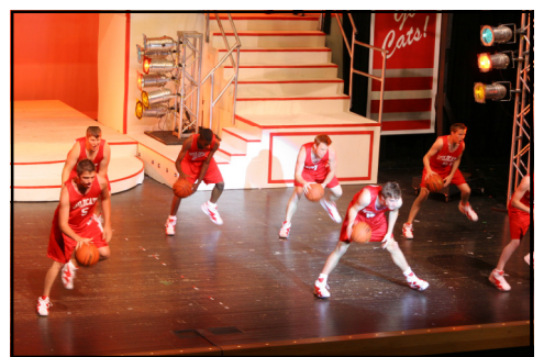
Wildcat players in costume